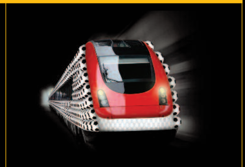
From sport to transport