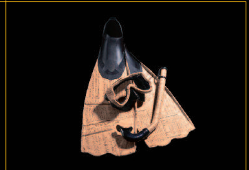
From maritime to finance