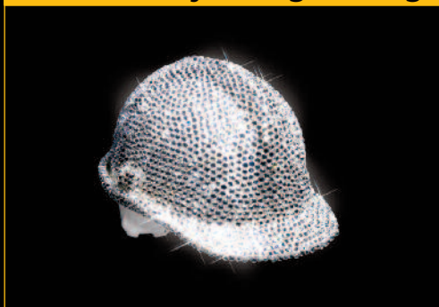
From construction to retail