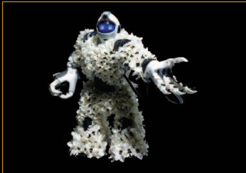
From floristry to engineering