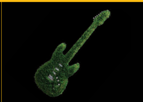
From music to environment